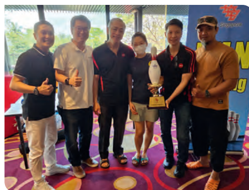
PHOTO: SAAA Fun Bowling Champion 2023 SATS Airport Services Pte Ltd